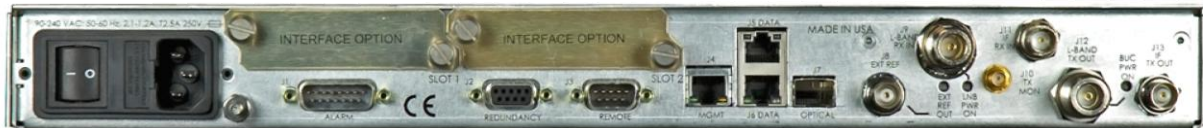
CDM-750 Rear Panel