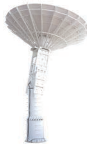
Gaia 300 6.3 to 7.3 meters