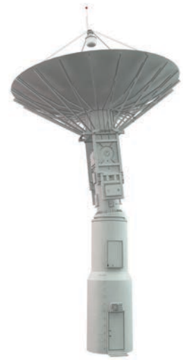
Gaia 400 9 to 11 meters