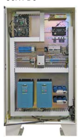
Outdoor SCR PDU