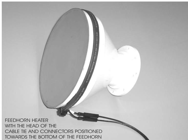
Feedhorn Heater Placement