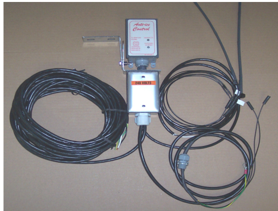
Control and Harness