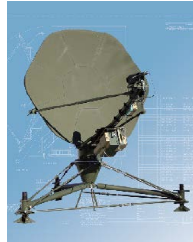
The Strength to Perform