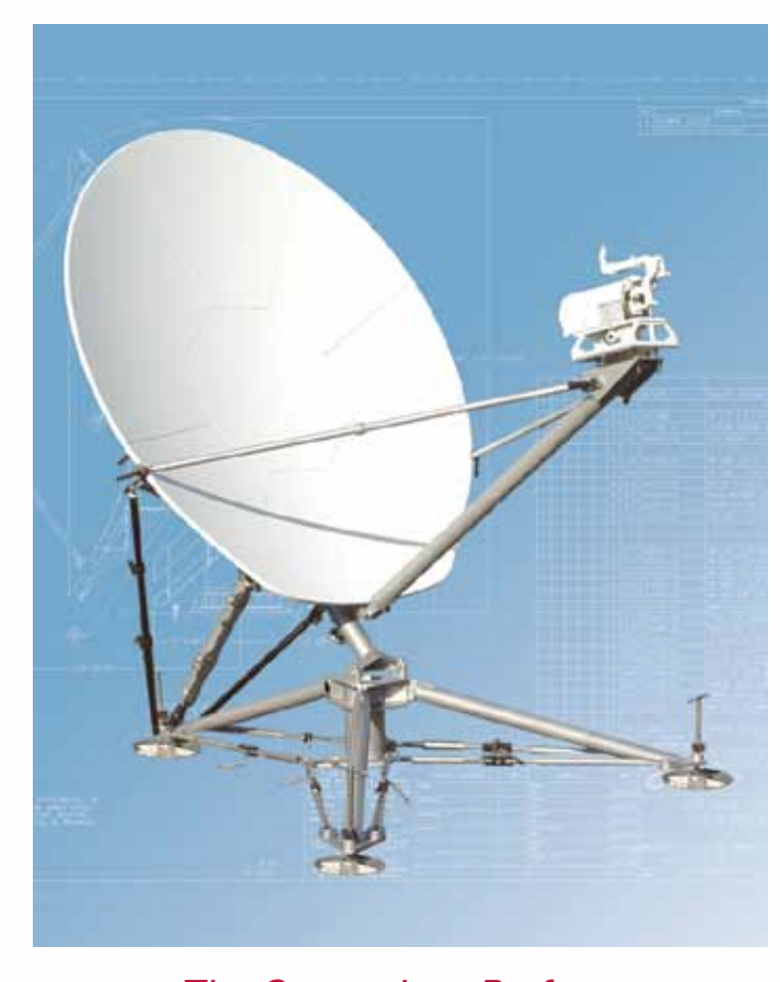
The Strength to Perform