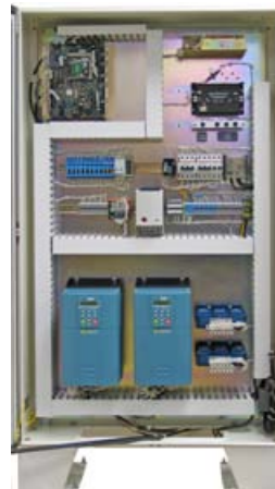
Outdoor SCR PDU