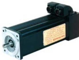
Brushless DC Motor