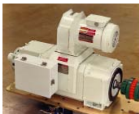
Shunt Field DC Motor