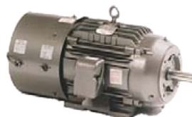
AC Vector Motor