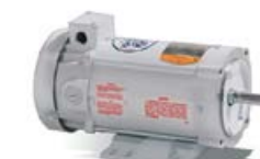
PM DC Motor