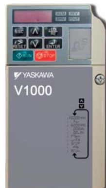
Yaskawa V1000 Motor Controller Drives