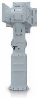
General View of AL-3400 Pedestal & System