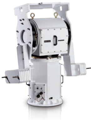
General View of AL-1600 Pedestal & System