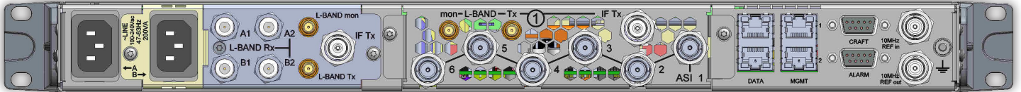
Figure: Dual modulator modem with ASI and GbE interfaces and dual power supply