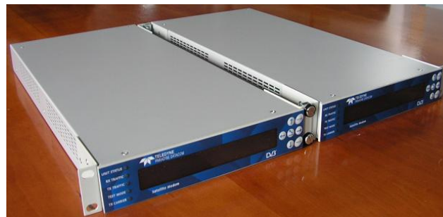
Side-by-side chassis, suitable for 19-inch rack mounting

PER v BER Note: A PER of 10e-7 is equivalent to a BER of 6.6 x 10e-11.